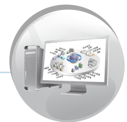
HL7 protocol to connect hospital system