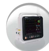
Bed to bed view via central monitor station