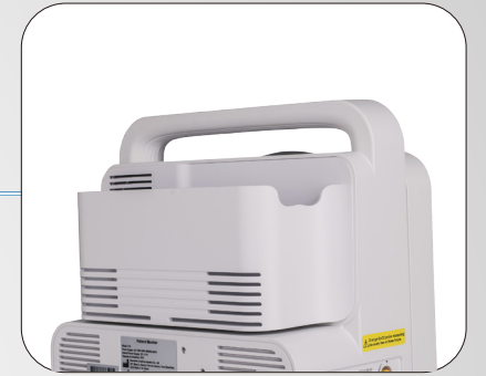
Accessory box for standard configurations