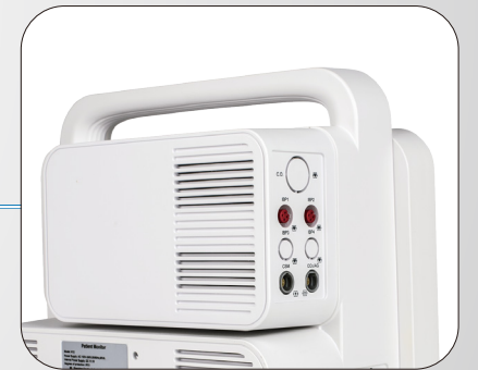
Parameter case with optional parameters